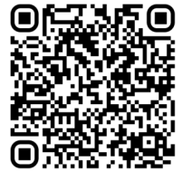
Amazon Gift List QR Code